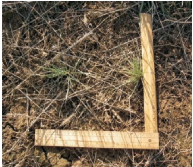
Fair stand 2 plants/ft 2