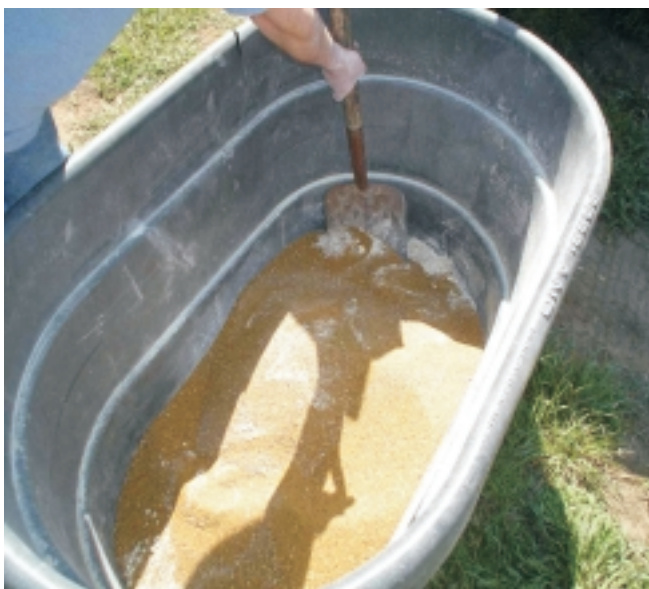
Applying self sticking powdered inoculant