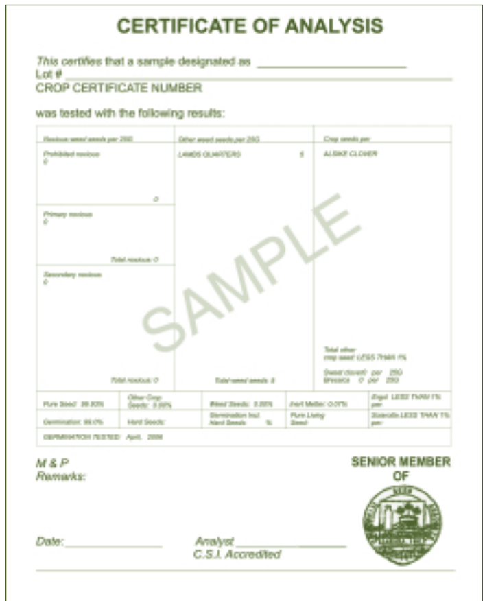
Certificate of Analysis

Most forage stands are in production for several years. Purchasing quality seed represents a sound investment and provides benefits throughout the life of the stand. The use of certified seed will allow for the selection of a cultivar with appropriate hardiness and disease resistance, as well as documented germination and purity. Using seed of a top yielding variety will increase the