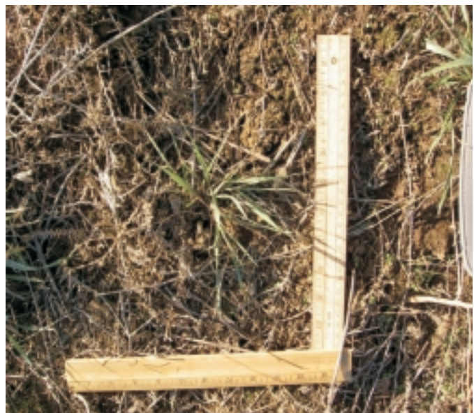
Poor stand <1 plants/ft 2