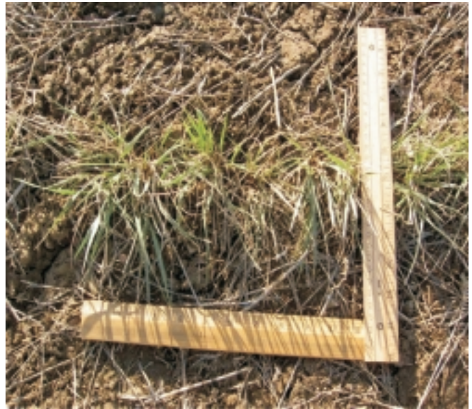
Satisfactory stand 4 plants/ft 2